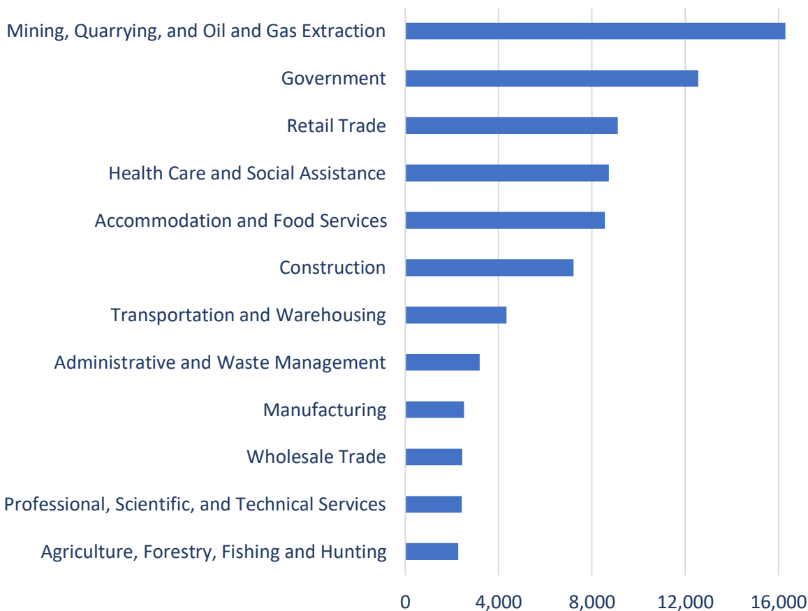
Employment, Top Industry Sectors, Region K

An Employment Location Quotient is an indexed value that illustrates the concentration of an industry in a particular location. An LQ of 1.0 indicates that employment in the target industry is exactly equal to the national average. An LQ of 2.0, then would indicate that employment in the target industry is double the national average.